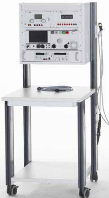
PROFI Mobile with HV Tester