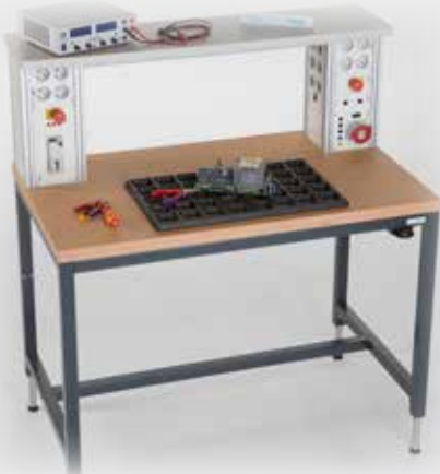
height adjustable with media supply and shelf

For furnishing mechanical workshops we offer bench solutions with solid wood or multiplex. The worktops are available in 30mm or 40mm and either with oiled or glazed surface. Of course even these set-ups offer various options for shelving or electrifications.