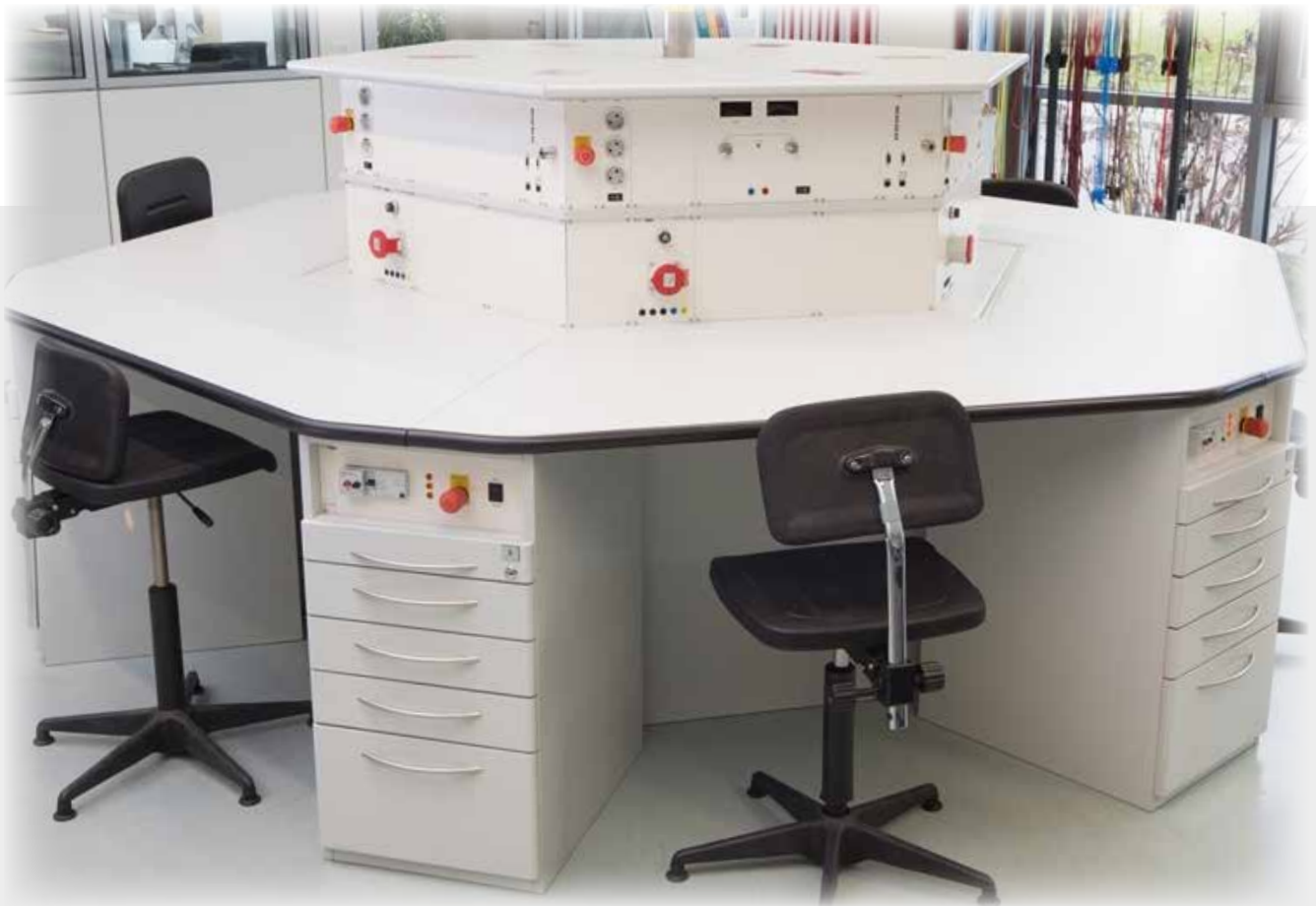
Team Workstation with retractable media channel and 2-level enabling (closed - 1phase operation - 3phase operation)