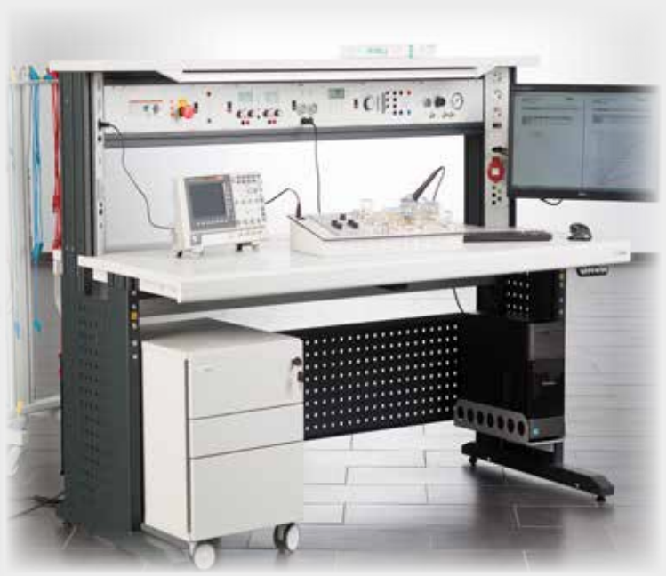
PROFI Bench with cantilever lift, either electric driven, with hand crank or manual adjustment