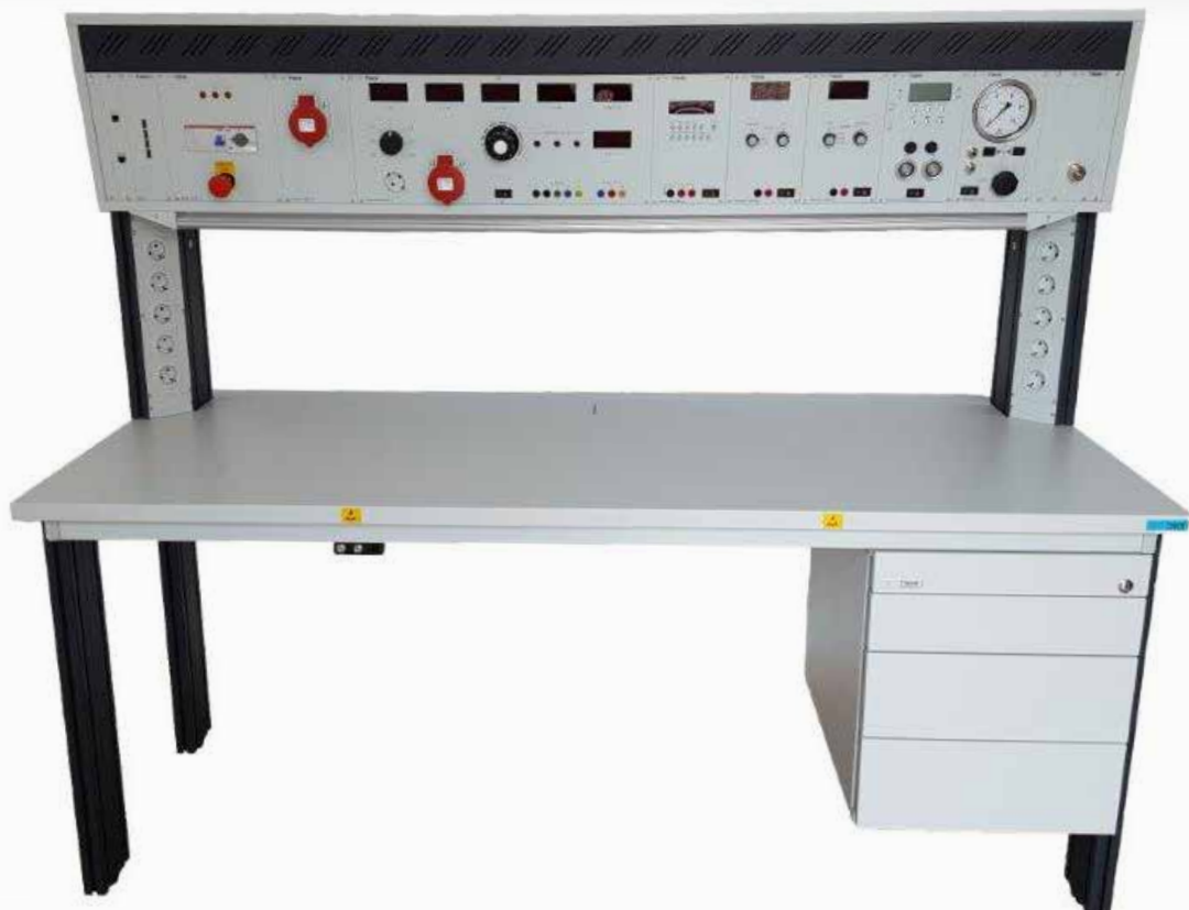
PROFI Bench in ESD with 3phase sources and analogue pressure calibrator