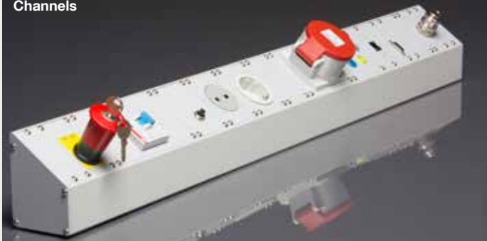
different types of flexibly equipped Media Channels