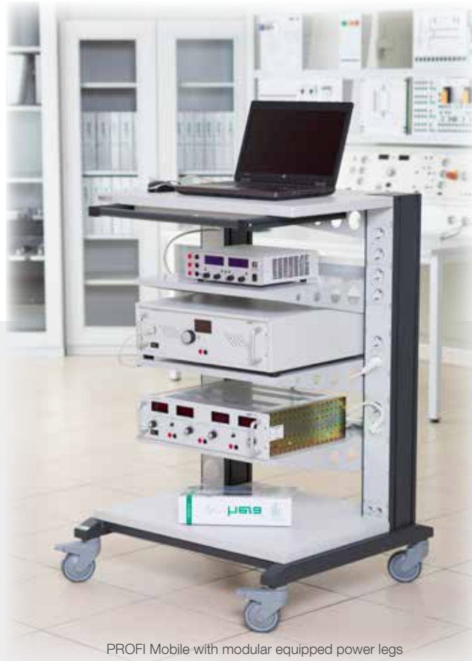
PROFI Mobile with modular equipped power legs