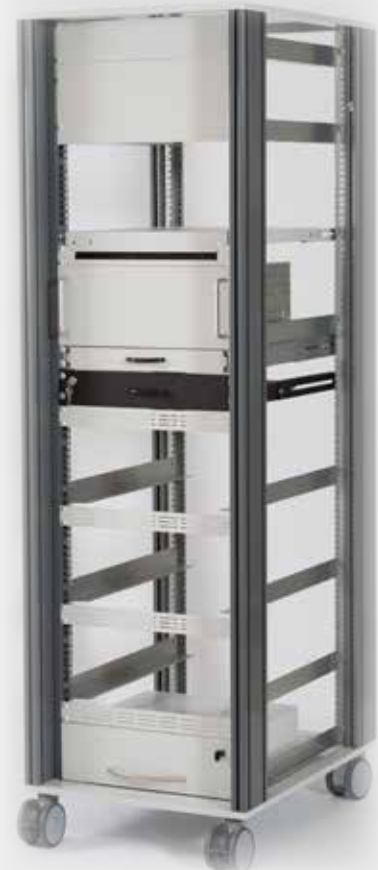
19" Test Rack, open or with side panels and door