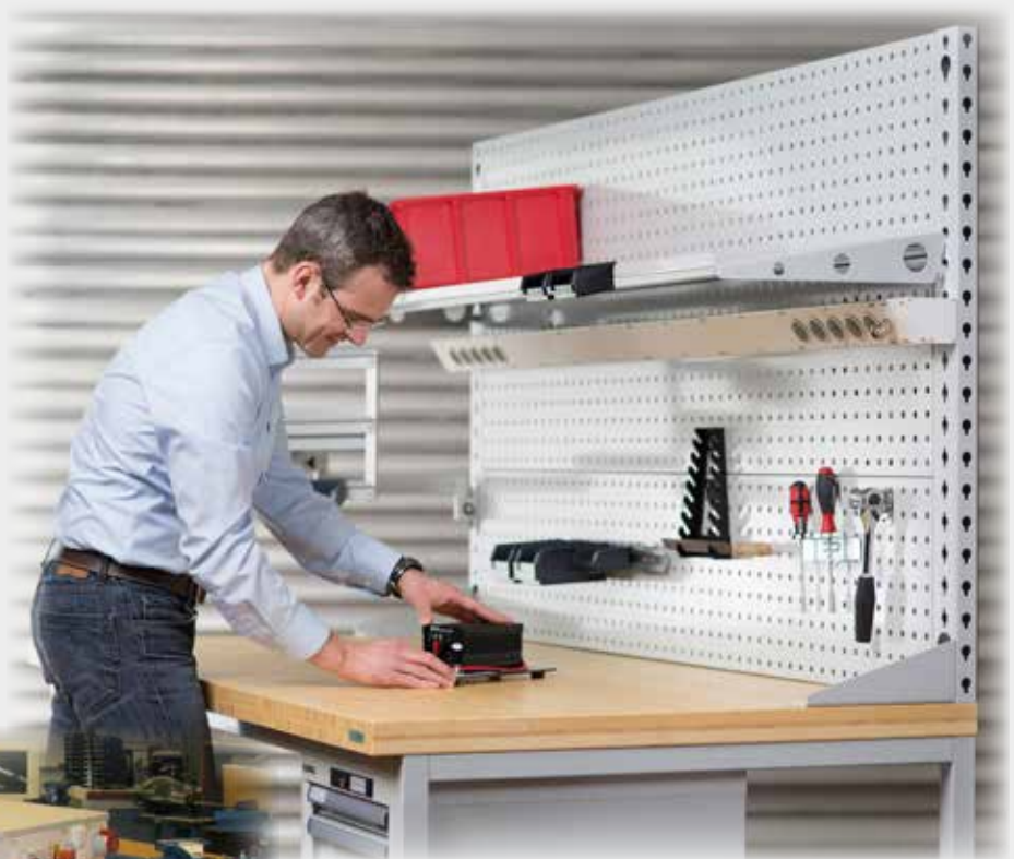
Workbench with perforated backplane for tool attachment and shelf