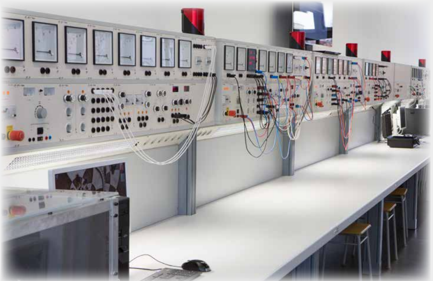
PROFI Classroom Bench with test and measurement set-up