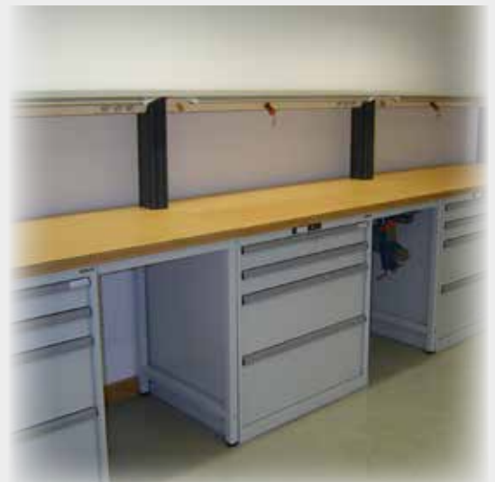
EASY Workshop with wooden bench top and vise