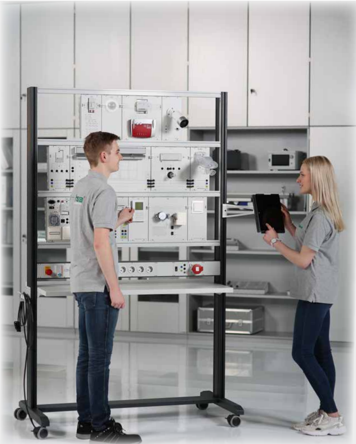
Training System for Home Automation