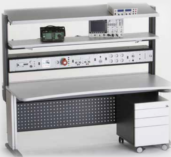
PROFI C-Lift Bench for a height adjustment between 740 - 1190mm and a lifting weight up to more than 600kg