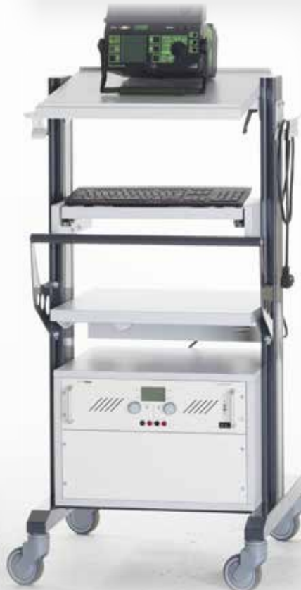
PROFI Mobile e.g. for Programming Tasks