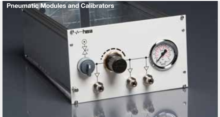
Pneumatic Modules and Calibrators