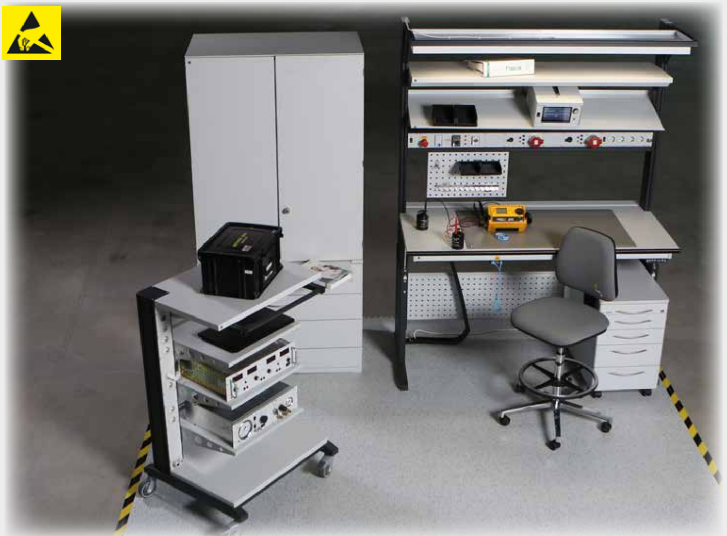
PROFI Workshop Equipment in ESD