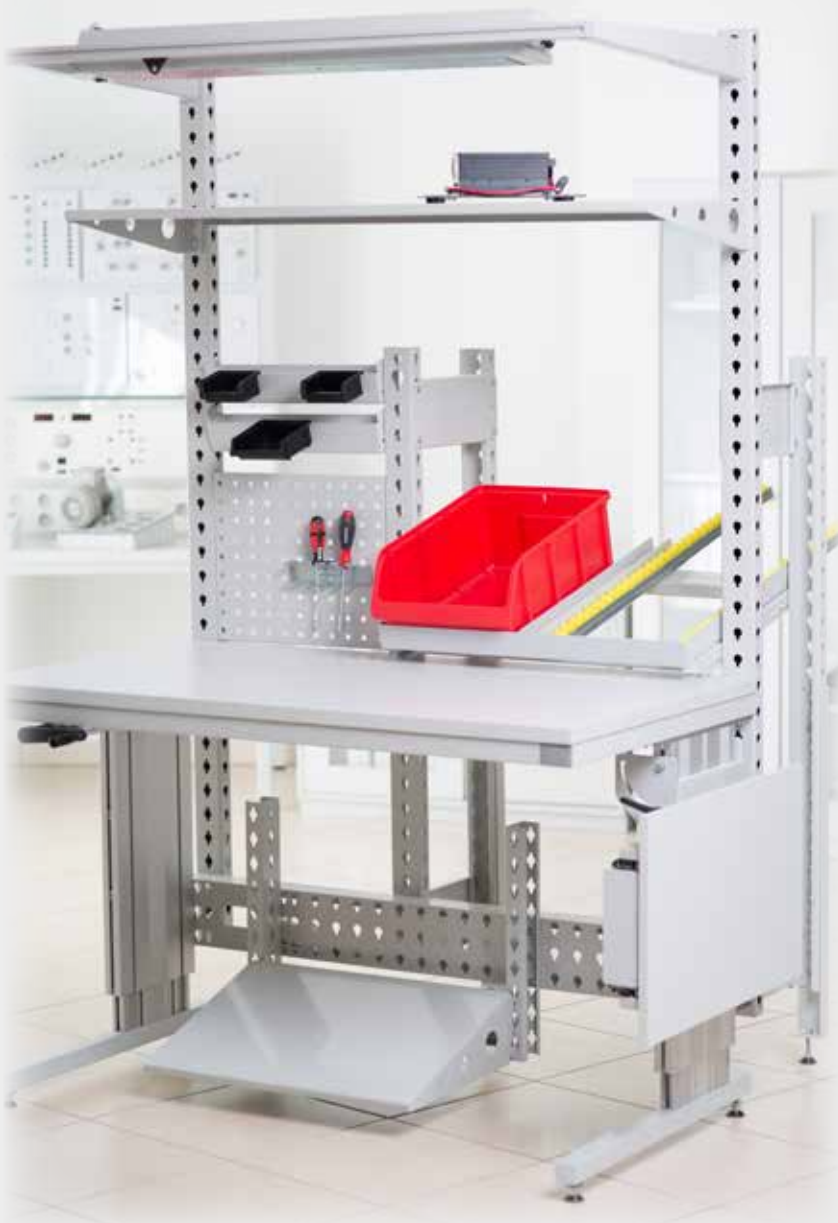
FLEX Workshop Bench in ESD, electrically height adjustable