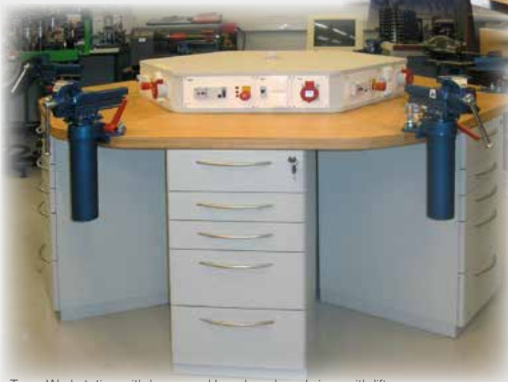
Team Workstation with hexagonal bench rack and vises with lifts