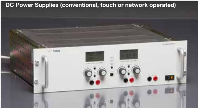
DC Power Supplies (conventional, touch or network operated)