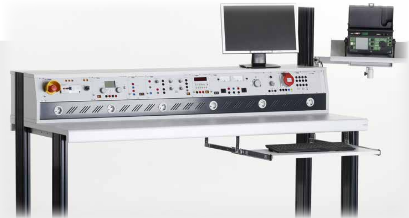
PROFI Bench with top-mount bench rack