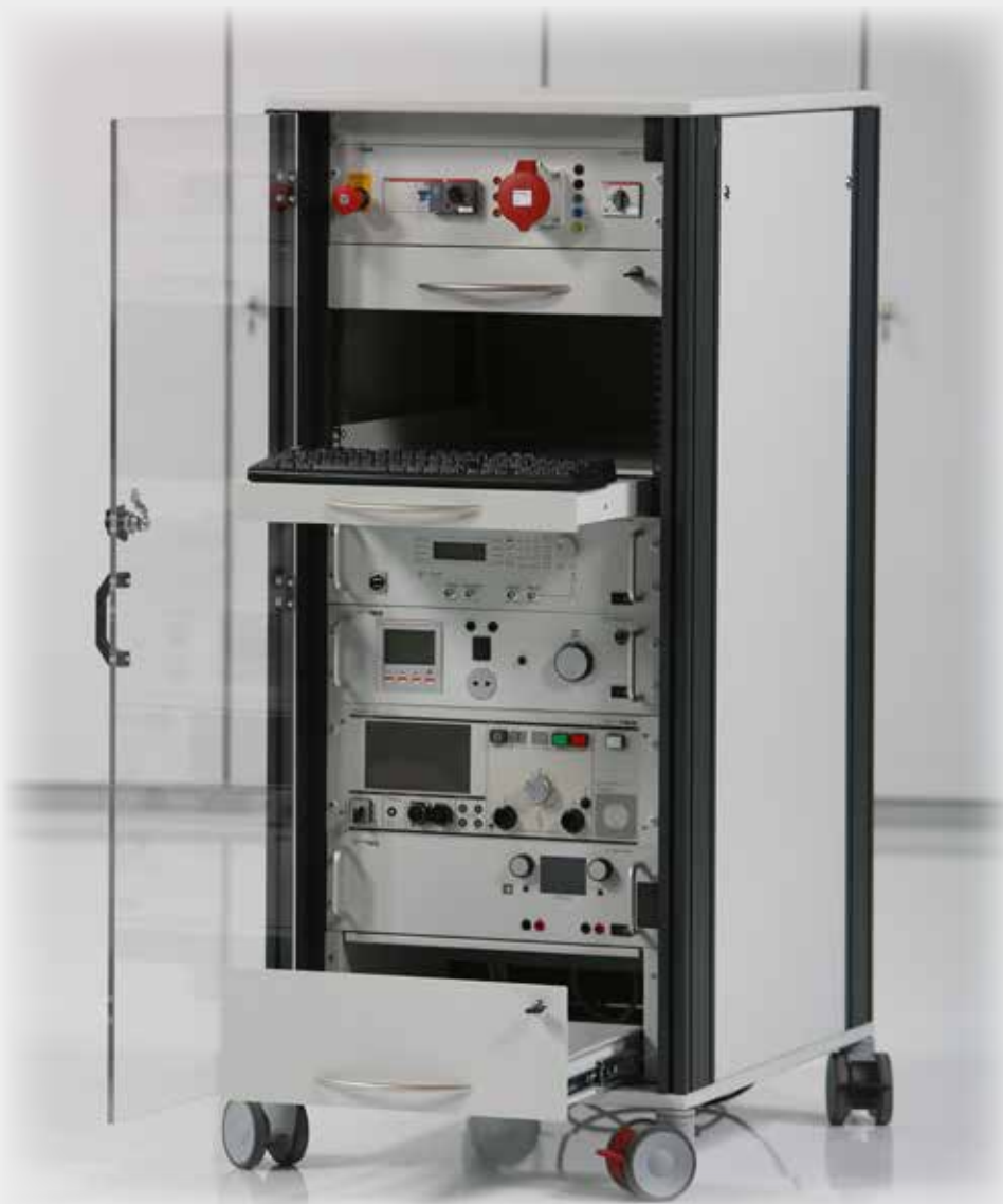
19" HV Test Rack

Lots of processes within a company demand full mobility of equipment. Trends like „CLEAN-DESK“ might even increase its significance. We use the product range of our benches and configure a mobile solution according to your special requirements, so you have everything within perfect reach. With respect to your underground or application, we offer casters in different sizes and materials, for different loads in ESD or non-ESD.