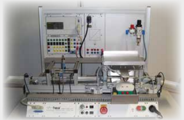
Mechatronic Systems with logic controller or PLC for control and automation engineering

hera Laborsysteme GmbH is not only specialized in industrial equipment but we also offer electrical laboratories and training systems for electric professions such as used in universities, colleges, vocational schools and training centers. Please ask for our educational product line.