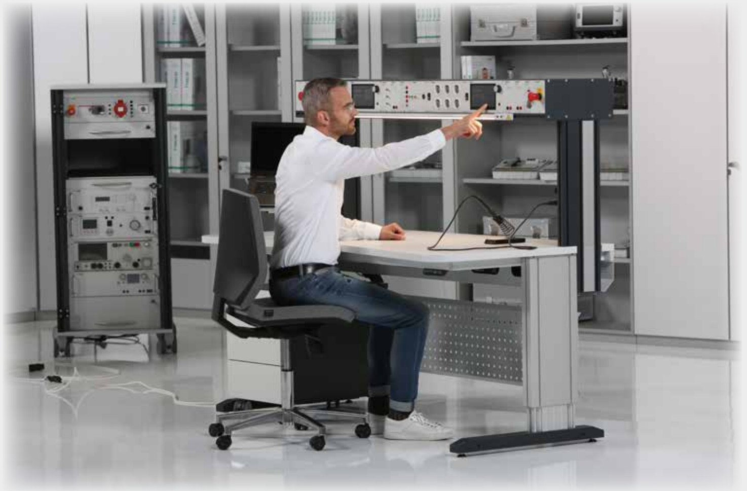
Height adjustable PROFI Bench with instrument rack in IMOD technology

Basically we offer benches, standard or ESD in various dimensions with suitable bench racks and a great selection of electrical instruments. But in fact it is much more! - We consequently absorbed the requirements of our broadly based customers over the past 60 years and developed an electrical laboratory system of finest quality, highest modularity and extraordinary variances. As a result we have trusting customers world wide in the field of oil, gas, petrochemistry, defence, aerospace, automotive, machinery construction, telecommunication, administration, research and testing institutions and many more.