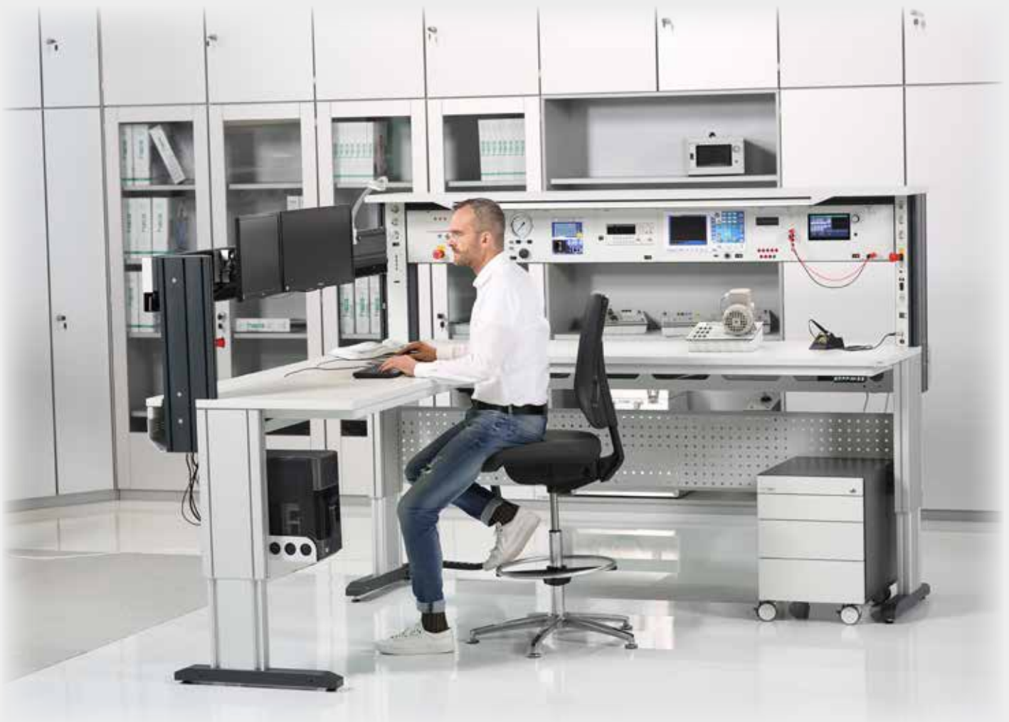
Height adjustable corner combination with with instrument - and PC bench

Employees are the capital of a company and you invest time and money to get them utmost qualified for their tasks. Shouldn't it be natural to take best possible care of their well being, then? - For this reason we offer all our benches even height adjustable, so they can be used in sitting or standing position. This will reduce the absence quota in your company considerably and thus raise efficiency. For practical or safety reason we also offer retractable bench racks!