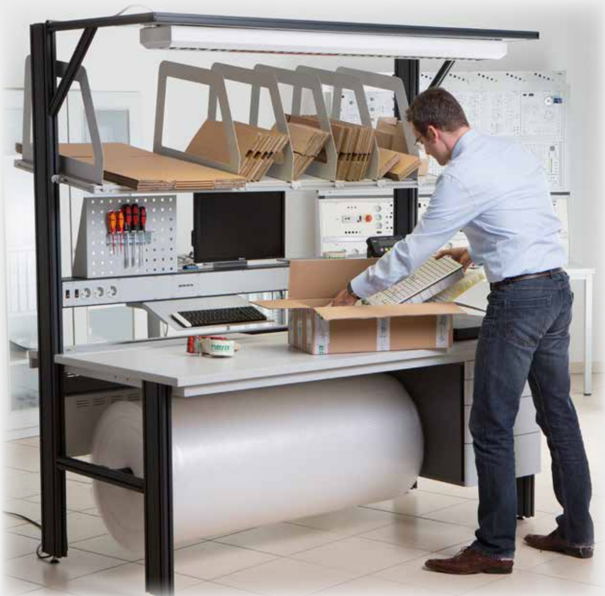
PROFI Packing Bench

For even more specific workstations we offer a large range of components, attach those to our standard bench and ... voilà, we have for example the perfect packing bench. So if you have any special requirements on your workstations, please ask for our possibilities. We have much more options than stated on our homepage or shown in our catalogue.