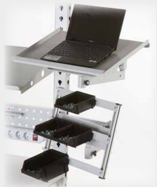
Swivel arm with different end pieces