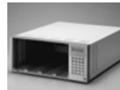
6334: Mainframe for 4 Load modules