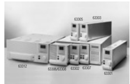
6330 Series High Speed DC Electronic Load Family