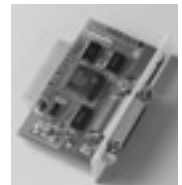
A630002: GPIB Interface